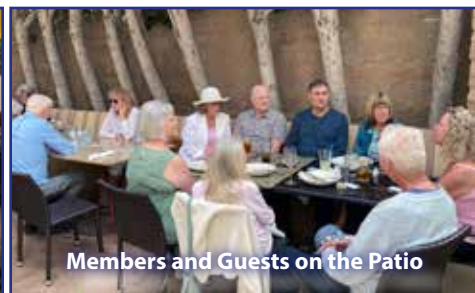
Members and Guests on the Patio