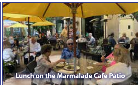
Lunch on the Marmalade Cafe Patio