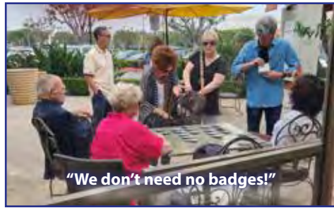
"We don't need no badges!"