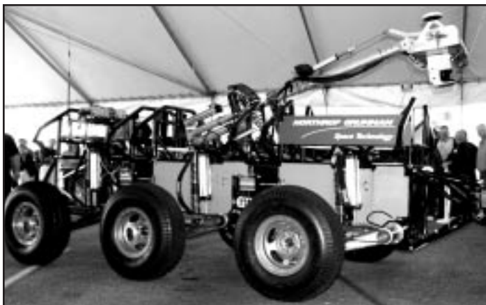
NGST's entry into the DARPA challenge at rollout in the parking lot at Space Park