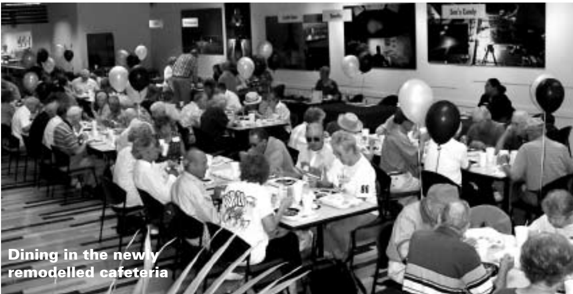
Dining in the newly remodeled cafeteria