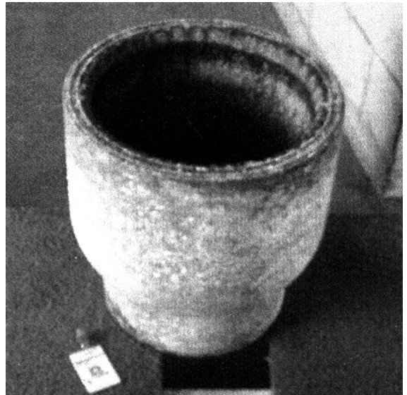
The liner for the LEM descent engine. A NG badge is near the base to scale the object.

Where is the part now? The NG Propulsion Group has claimed it. They are working on a proposal and want to show their customer the earlier part from TRW. Darrell Ausherman, TRA VP and leader of our Archives activities, would like to add it to the Northrop Grumman Archives and hold it until an exhibition place can be found for it.