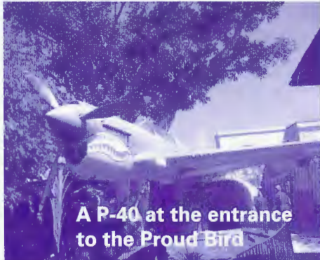
A P-40 at the entrance to the Proud Bird