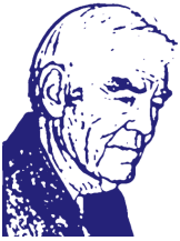
By Frank Warren

p.m. PST. Soaring up to 60,000 feet, the Euro Hawk® has logged nearly 100 total flight hours since its maiden flight approximately five months ago.