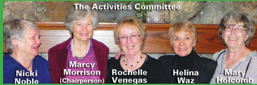
The Activities Committee