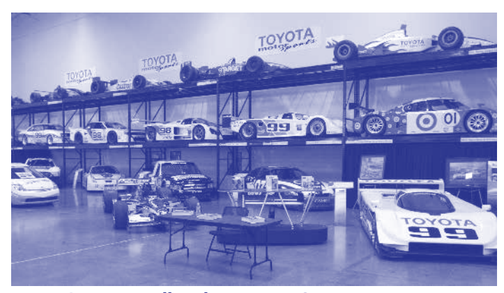
Race car wall at the Toyota USA Auto Museum

Please make your reservations by July 11th. You can reserve and pay by mail by sending in the form below. Or, you can go to our website to reserve and pay on line. Reserve promptly; this is bound to be a full event ◆◆◆