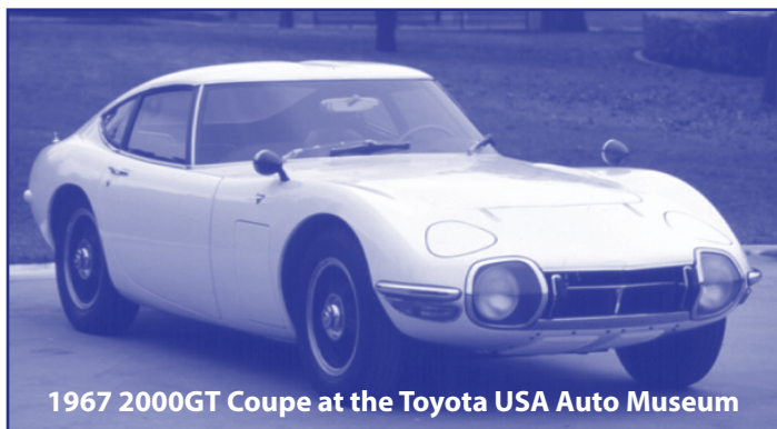
1967 2000GT Coupe at the Toyota USA Auto Museum

Please make your reservations by July 11. You can go to our website to reserve and pay on line. Or, you can leave a message on our phone with your name, phone number, and guest names. We will hold your reservation for you to pay at the door for the $25 price. Reserve promptly; time is running out. ♦♦♦♦