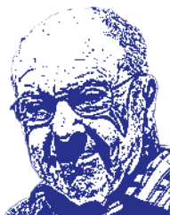
By Al Hausrath