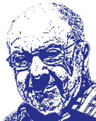
By Al Hausrath