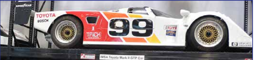
MSA Toyota Mark II GTP Car