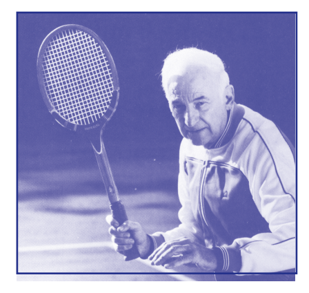
Si at bis tennis club.