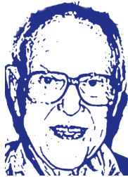
By Al Hausrath