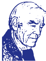
By Frank Warren

➤ EL SEGUNDO, CA — NGAS is developing new, advanced unmanned surveillance, reconnaissance (ISR), and strike capabilities systems. The next-generation Tactical Exploited Reconnaissance Node (Tern) program is one example of several in progress. Tern would enable greater mission capability and flexibility without the need for establishing fixed land bases or deploying aircraft carriers. These developments are under the joint leadership of the Defense Advanced Research Projects Agency (DARPA) and the Office of Naval Research.