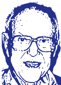
By Al Hausrath