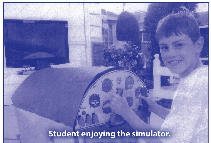
Student enjoying the simulator.

I am 88 years old and have been married for 64 years. We have 4 children; 2 of which are retired, 7 grandchildren, and 9 great-grand children. I am truly blessed.