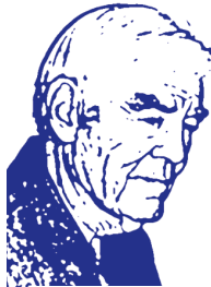
By Frank Warren

Northrop Grumman's submission was based on a navigational payload prototype built and tested over a radio frequency range in 2015, and a mission-tailored space vehicle leveraging the proven GPS supplier base. For its clean sheet design, the company drew on expertise with technology currently operating on Air Force and other Department of Defense satellites. In addition to current GPS III capabilities, the full-scale, fully populated prototype demonstrated significantly increased capacity and enhanced transmission power for the military code, a critical capability for operating in regions of the world where jamming is prevalent.