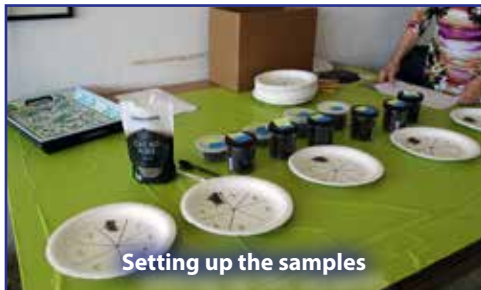
Setting up the samples