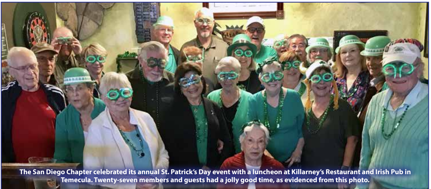
The San Diego Chapter celebrated its annual St. Patrick's Day event with a luncheon at Killarney's Restaurant and Irish Pub in Temecula. Twenty-seven members and guests had a jolly good time, as evidenced from this photo.

Do you belong to or know of clubs/lodges/banquet halls that can handle 100-150 people that might be available for future South Bay TRA events? If so, please contact TRA using the information on Page 2.